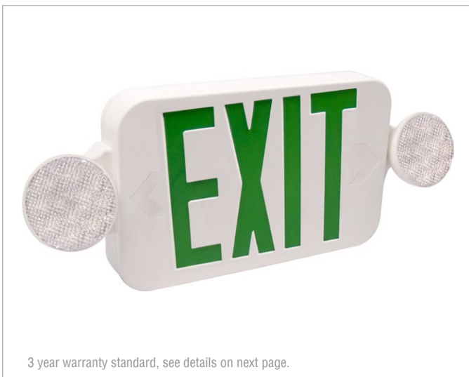
3 year warranty standard, see details on next page.